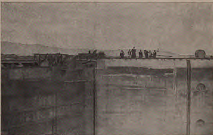
"The week never passed that a group of priests from South America might not be seen peering over the dizzy precipice of Gatun locks"